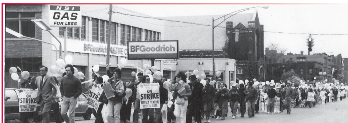
CWA Local 1168 RNs on Strike Against Buffalo General -1983